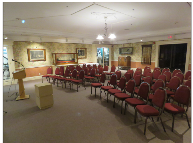
New Room: A recent reorganization of our exhibits has freed up a room on the Museum's third floor for such things as lectures, events, and meetings. The nicely decorated space is also open for rentals. Check out our website for more information.