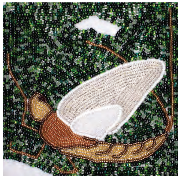
Exhibit available January 13 - April 23