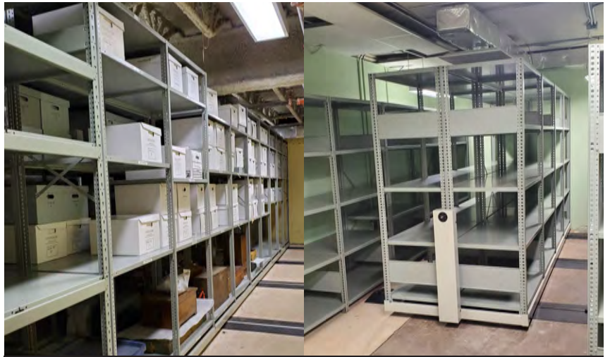
New high-density racks constructed in the second floor storage (left) and ground floor storage (right)

The Museum is grateful for the support of the Department of Canadian Heritage for both of these projects.