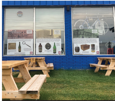
Exhibit at Sleeping Giant Brewing Co.