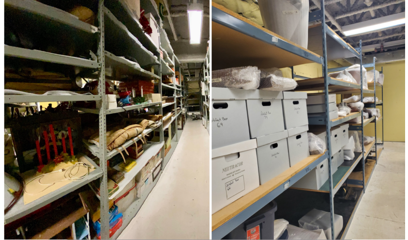
Before & after photo of the Second Floor Storage